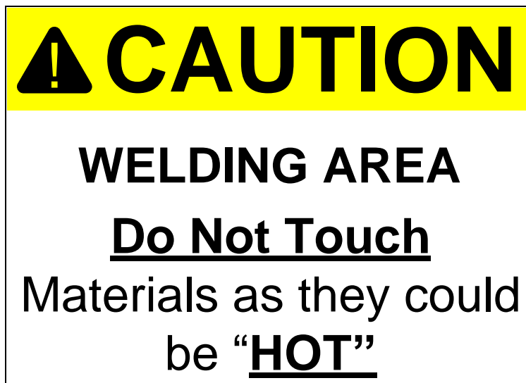
Figure 2, to be posted whenever hot work is left unattended